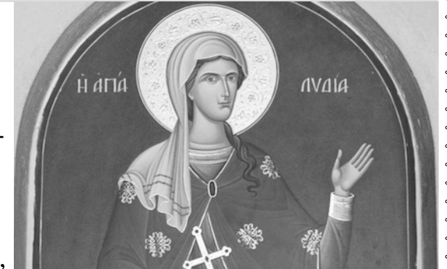
You can find this icon of Saint Lydia in the church named after her in Philippi, the town in Greece where she lived.

You probably became Christian as a baby , when your parents took you to church to be baptized. Maybe your parents became Christian when their parents took them to church to be baptized. And probably, so did their parents!